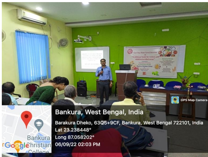
Bankura, West Bengal, India

Barakura Dheko, 63Q5+9CF, Bankura, West Bengal 722101, India Lat 23.238448° Long 87.058202° 06/09/22 02:03 PM