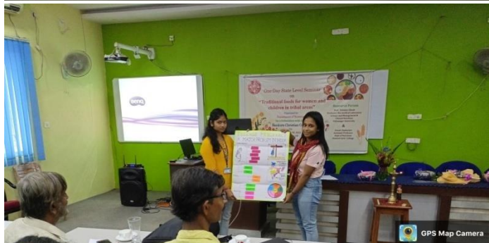
Bankura, West Bengal, India

63Q5+H7J, Bankura, West Bengal 722101, India Lat 23.238787° Long 87.058004° 06/09/22 01:48 PM