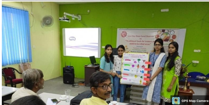
Bankura, West Bengal, India

63Q5+84Q, Bankura Christian College Campus Rd, Bankura, West Bengal 722101, India Lat 23.238526° Long 87.058153° 06/09/22 01:50 PM