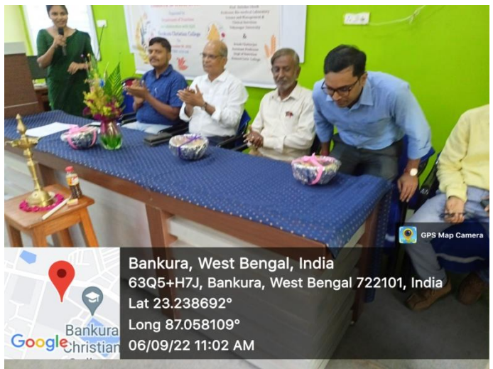
Bankura, West Bengal, India

Barakura Dheko, 63Q5+9CF, Bankura, West Bengal 722101, India Lat 23.238448° Long 87.058202° 06/09/22 02:03 PM